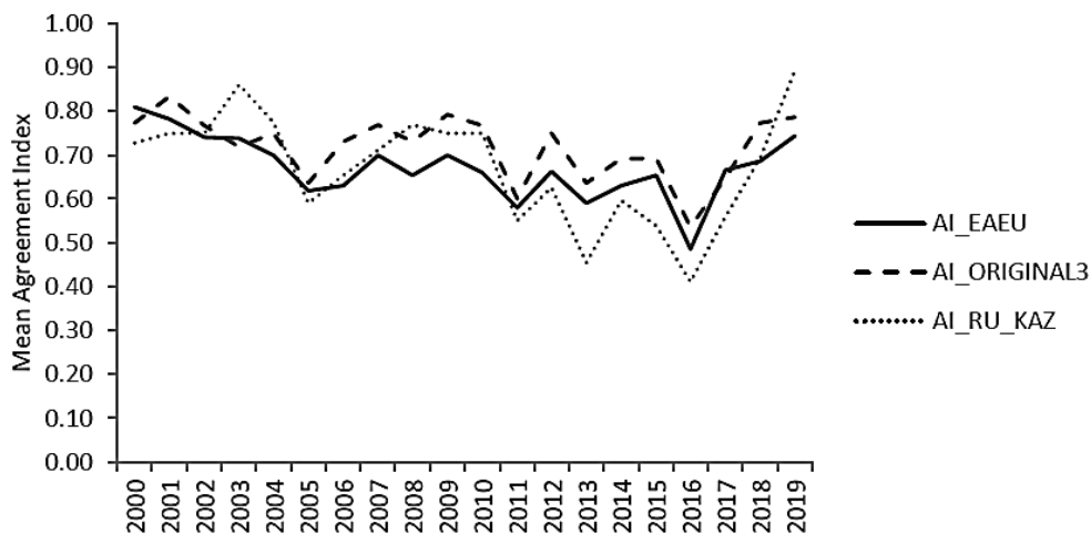
Fig. 3. AI Scores for the EAEU members in the UNGA (2000–2020)

The first observation to be made is the fact that all three groupings share a similar general trend: all AI indices gradually declined until 2016, after which they increased again, with values reaching the levels of the early 2000s. Another important observation is that all Eurasian cohesion levels experienced fluctuations up and down from year to year. Historically, the highest AI value for the entire EAEU was scored in 2000 (0.81) and for the Eurasian troika in 2001 (0.83). Interestingly, unlike these two groupings, the Russia-Kazakhstan pairing reached the highest point in 2019 with an index of 0.89. Moreover, the AI approach highlights a sharp drop in 2016, when the lowest level of convergence was observed for all Eurasian groupings. It is also noteworthy that, compared to the EAEU as a whole, the Russia-Kazakhstan pair exhibited a higher level of cohesion until 2010, after which the pair became the least cohesive group, at least until the 74 th session. Finally, the main observation to be made for the troika countries, in which the integration project continues to enjoy consistent public support (Vinokurov 2018), is that on the whole, the degree of voting convergence among the three was slightly higher than the cohesion of the other two groupings.