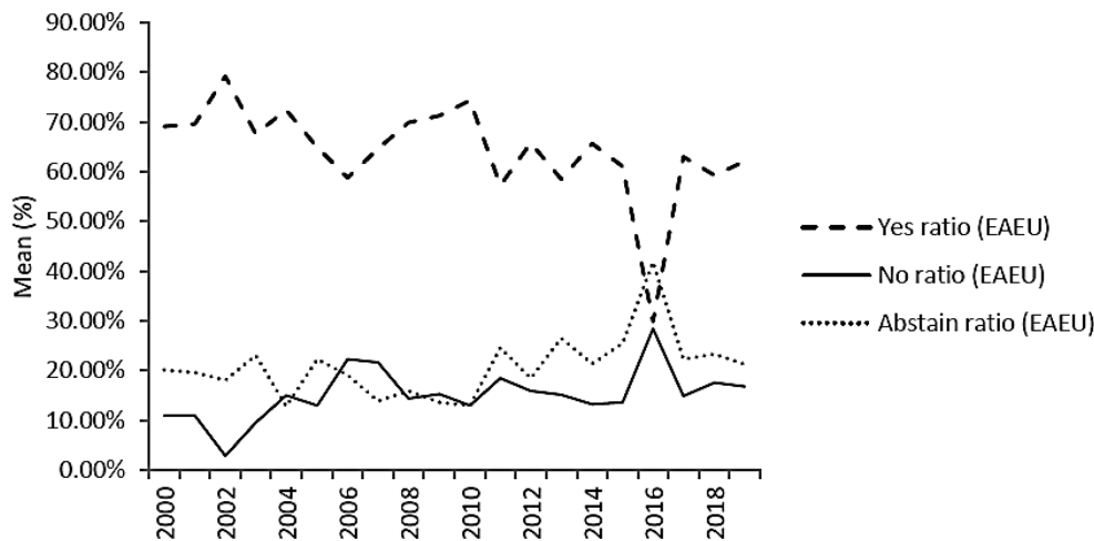
Fig. 2. Vote choice in the UNGA on ‘important’ issues, 2000–2020: the EAEU members

In addition, Figures 1 and 2 graphically show the proportion of ‘yes’, ‘no’ and ‘abstentions’ over time for the entire UNGA membership and for the Eurasian nations. The share of ayes as compared to nays is higher for the global community than for the EAEU. The figures also suggest that global voting patterns appear to be more stable than those of the EAEU. While positive votes on important resolutions for the UNGA as a whole fluctuate between about 60 and 80 per cent over the period covered, there are significant ups and downs in the EAEU’s votes over time. It is also very noticeable that, from 2000 onwards, EAEU’s positive voting starts to gradually decline, with the lowest value of 30 per cent cast in 2016, followed by a spike in positive votes (63 %) and then remaining at about this level (see Figure 2). Such variations suggest that future research could focus on the reasons associated with these fluctuations.